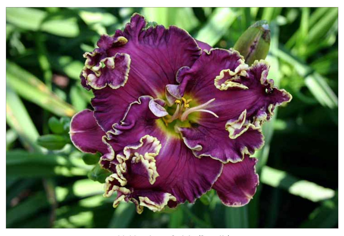
H. 'Hurricane Swirls' (Stamile)