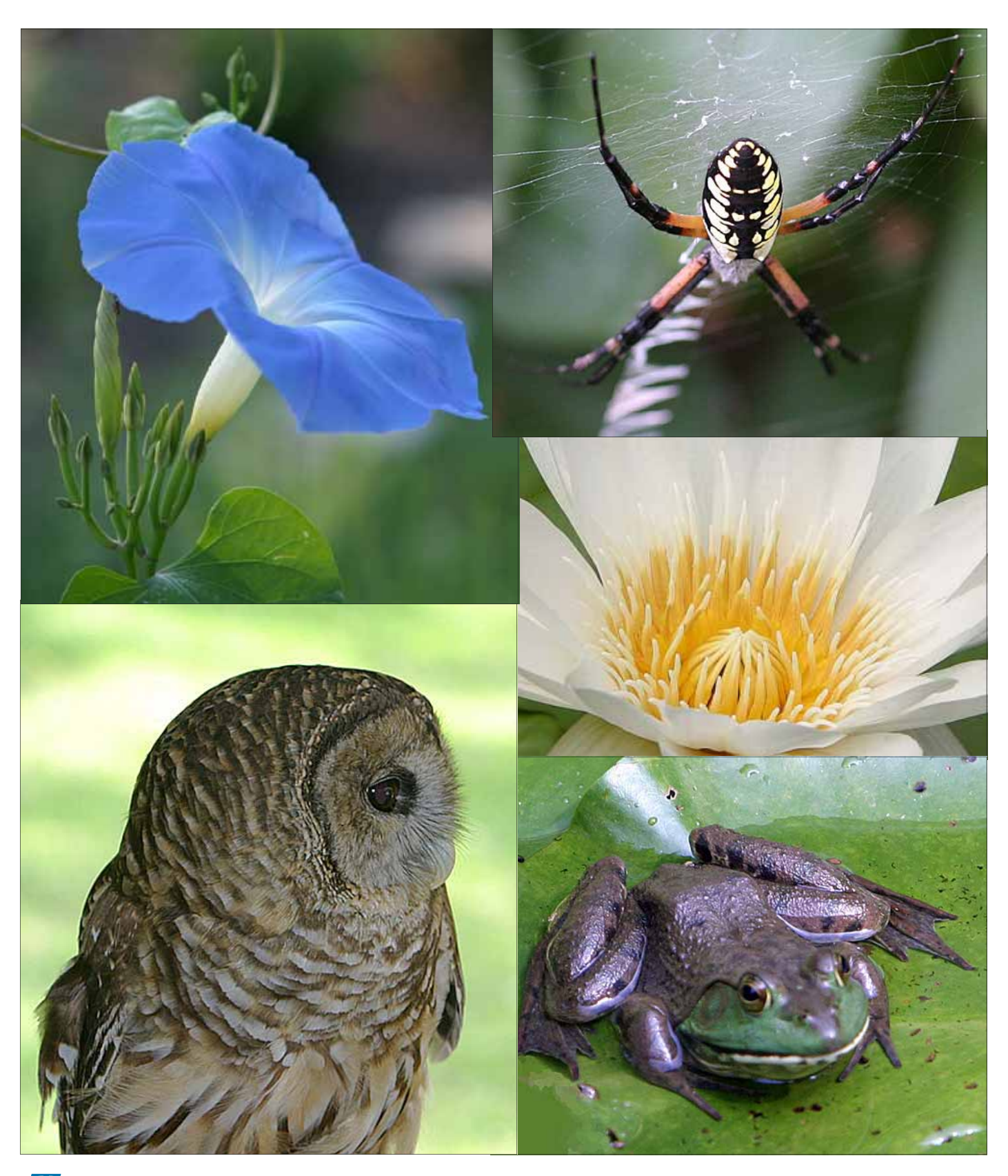
The amateur photography of Paul Aucoin shows a master's eye for detail. On the previous page, clockwise from left to right are photos of H. 'Toward the Blue,' a male Eastern Tiger Swallowtail, an Aucoin future (H. 'Crystal Singer x H. 'Spacecoast Dixie Chick'), a Georgia O'Keeffe-like image of a coneflower, a tropical sunset, and a columbine; on this page, an Ipomoea tricolor 'Heavenly Blue' Morning glory, a Black-and-yellow Argiope, a close-up of a white lotus, a frog on a lily pad, and a Barred Owl also provide outstanding images.