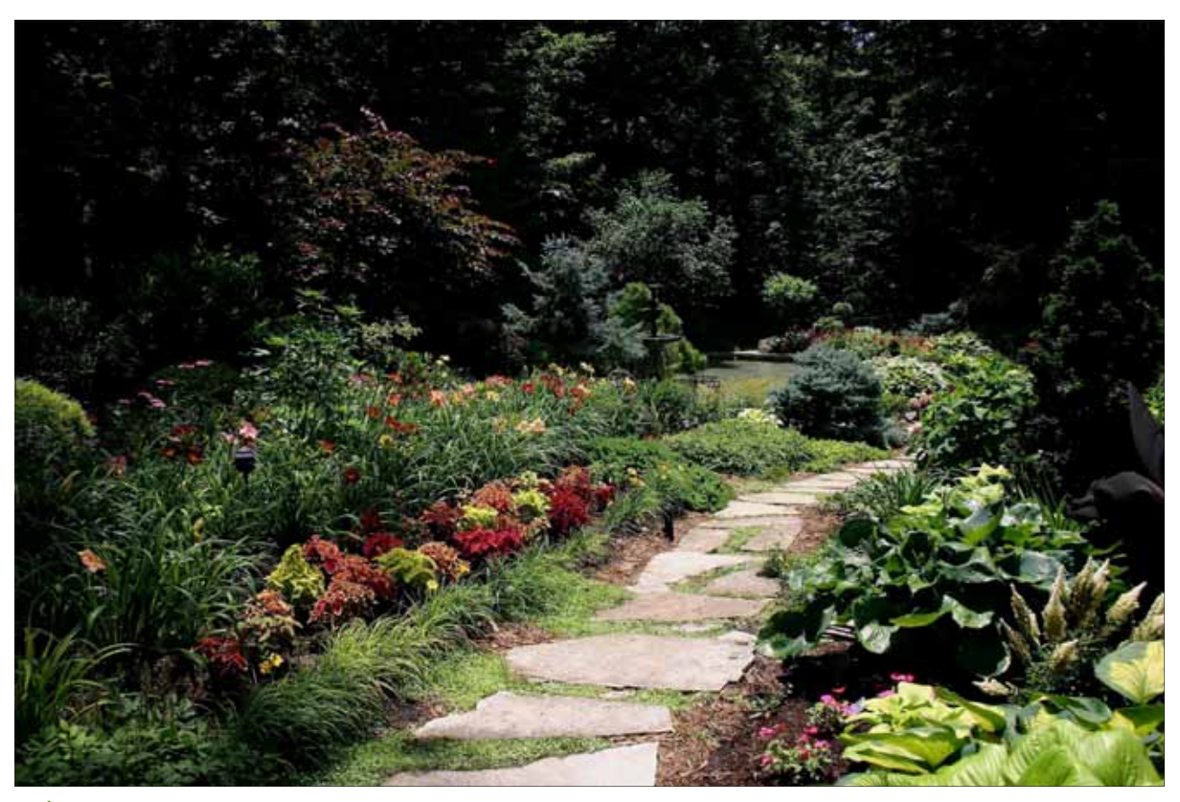
A stone pathway (above) leads past daylilies to a reflection pond in the Bramlage garden. The rich greens and blues of hostas (below), along with coleuses, begonias, and dwarf Japanese maples, lend a myriad of color, shape, and texture. An Amish built wood bridge crosses the pond at the far reach of the garden.