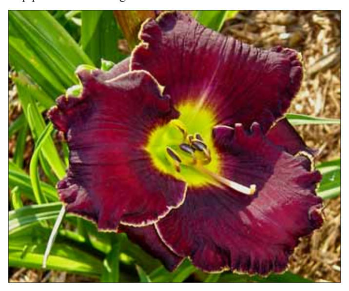
H. 'Johnny Cash' (Stamile '04) appears to be a vigorous grower, sending up three or four scapes soon after arrival, and when snapped off, more later.

June. Finally Mother Nature relented and sent abundant rain mixed with sunshine and then things began to pop! Cultivars which began the season with blooms down in the foliage sent up more scapes of normal height, bloom size seemed to increase by 20% almost overnight and excitement built as peak bloom approached. With nearly 900 named cultivars growing here, it is always difficult to select only a few favorites; however, listed below are some which were special favorites and top performers during the 2005 season.