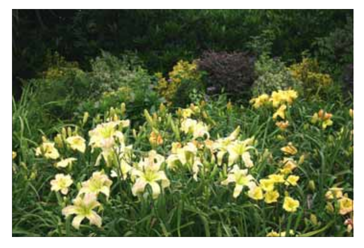
Overexposure is a common problem when shooting garden scenes. Shooting manually can help overcome this tendency.

what he gets. That's why an SLR is so important, either for regular cameras or digital ones. The best of the new digital cameras, now reasonably priced, are SLR's. To me, one of the most annoying aspects of the close-up photography of daylilies is for a photographer to cut off a portion of a petal or sepal, unless you're trying for a