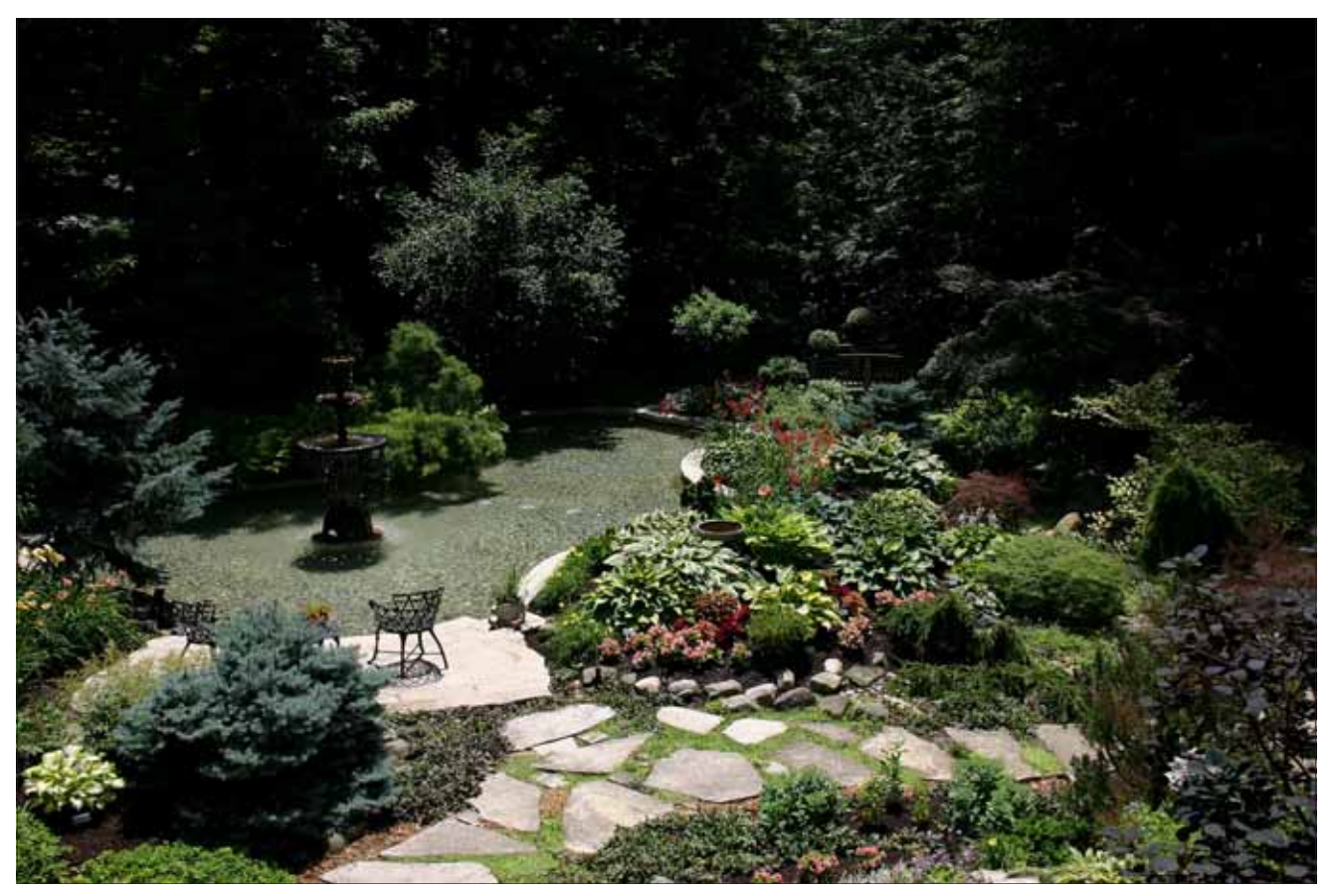
Beech Wood Gardens at the National Convention