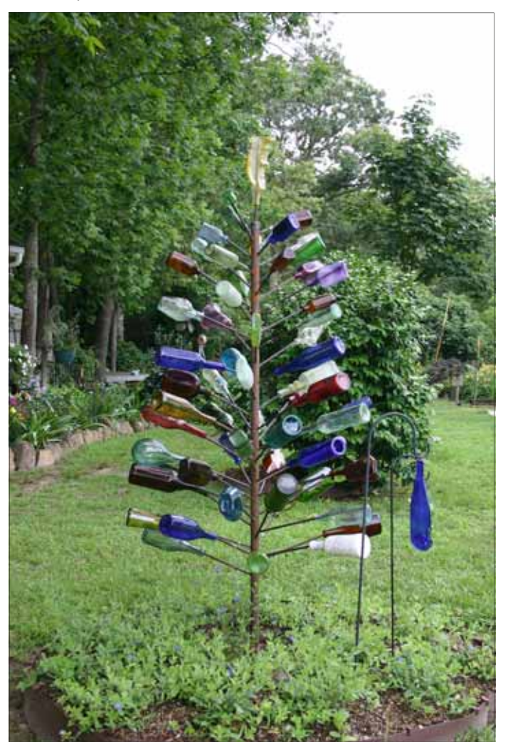
This bottle tree adds a folksy touch to the garden. The colored bottles capture evil spirits.

'Victoria'; among the annuals are Petunia 'Purple Wave' planted as borders to the beds. In the summer, rudbeckias provide color. In the fall, Barbara uses the fruit of several apple haws to make a tart jelly.