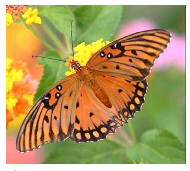
Cedar Waxwing (left) catches a berry. A Gulf Fritillary (above) poses on gold verbena.