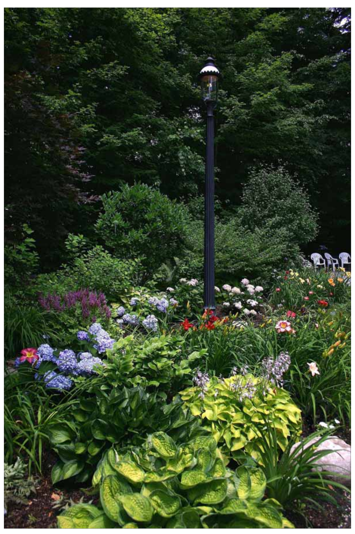
B eech Wood Gardens in Indian Hill, Ohio, is one of the most elegant gardens I have ever seen. The woodland background provides an enchanting setting.