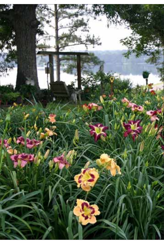
A nother splendid view in the display garden features Lake Serene in the background.

Recently, Earl has been working with small flowered "blue" eyes he has obtained from Elizabeth