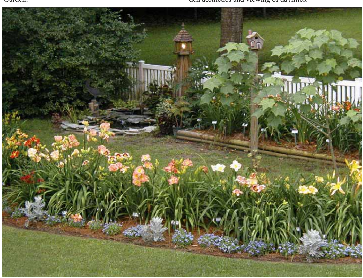
lue ageratum and the silvery leaf tones of dusty miller provide a striking yet pleasing contrast to green daylily foliage at the Bayou Bend garden.

Subsequent phases of garden development involved preparation of linear beds along fence lines at the sides and rear of the property. Beds of various shapes have been added and have done much to promote garden aesthetics and viewing of daylilies.