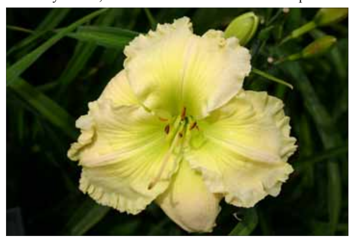
Shooting manually results in a better exposed photograph, sacrificing some of the detail in the background to gain more detail in the flower. Notice the improved focus, color, and composition (flower presentation). A lime yellow blend, H. 'Russell Henry Taft' is more accurate in this photo.

hoping for a cloud to cover the sun, so that I can get that special shot. With some digital cameras, such as the Canon Rebel, however, the cool tones may be so strong that lavenders and purples will be overly enhanced, particularly in early morning light, and some further reduction of the blue in the purple may be necessary. Photoshop 2.0 is a very simple, easy to use program; it came with my Rebel, and it is about all one needs to pull the