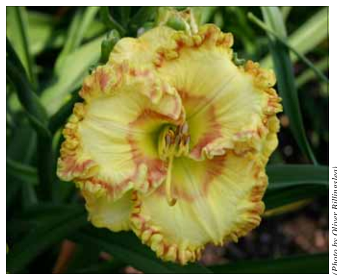
# FS-4-33 (F. Smith)

Pat Stamile had a very strange daylily in bloom, #2372, potential forerunner of yet another unusual form. It is a rounded heavily ruffled deep reddish purple flower, with what I called "hurricane swirls" curling in toward the throat. The dark flower appears like a storm cloud with these finely etched gold swirls (the flower is lined with a penciled edge of gold) riding inward. Very distinctive and beautiful! Given the hurricanes Florida suffered through last year and this, what an interesting daylily!