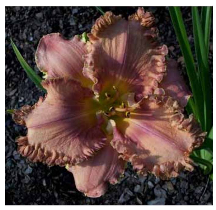
An intriguing color, H. 'Prince of Swan Lake' has a 5½" light brown bloom with a darker rose-purple eye and edge.