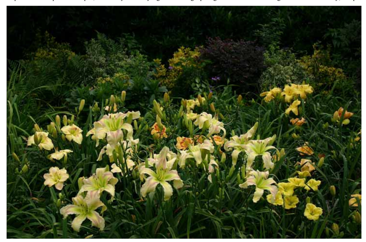
Getting an accurate exposure of this clump of H. 'Wiregrass Greenstar' (Cooper, E. '93) is fairly easy, thanks to the digital capability one has with viewing what you've just taken. There are many ways to lighten the dark area in the photo above.

Georgia O'Keeffe effect. Shoes, dead leaves, dead blooms, and general background clutter are all distracting, especially those omnipresent garden labels ranging from metal stakes to telephone wires, even to embroidery floss. These all present problems when photographing in someone else's garden. Fortunately, crop-