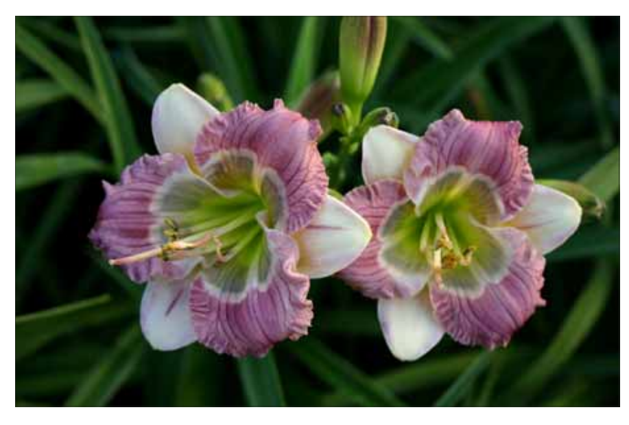
# D565