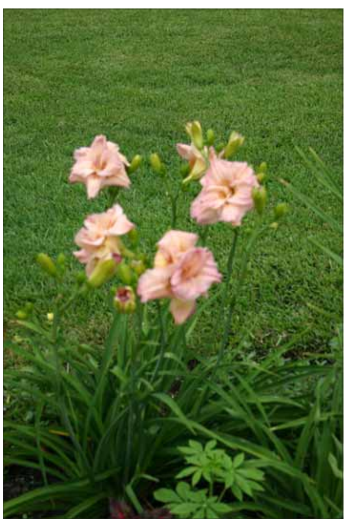
Exactly where the focus is in this picture, I'm uncertain. I think it may be in the field of grass behind the daylily. Cropping the top of the photograph would help, but then all you've got is a totally blurred picture. Here, H. 'Music of the Master' (Joiner, J. '99) actually looks stunted.

With a good camera of any sort, focus is probably the easiest thing to achieve. One just has to be able to estimate the distance between the object and camera and have a steady hand, or if you have an automatic focus on your camera, know that it is executing properly in regards to the subject. Sometimes with daylily photography, something as simple as anthers can throw a bloom slightly out of focus. There's plenty of informa-