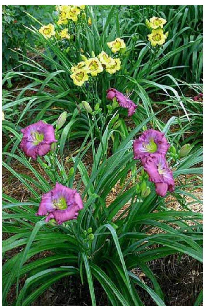
The clump of H. 'Lavender Blue Baby' is a bit more accurate, after a "color" and "focus" adjustment in Photoshop 2.0. I erased the intrusive label and the white spot below the nearest bloom, although I left the wire running through the background. Though it takes time, a photograph can be enhanced by removing dead leaves, etc.

What Digital Photography 101 can do is basically provide a slight improvement in respect to these four basic components of photography, though further enhancement requires a major effort and an investment of time.