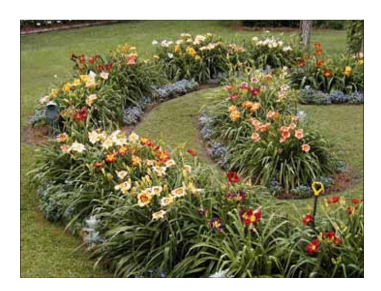
A t Bayou Bend, concentric circular beds center on a fountain, on top of which sits a pelican, reflective of the garden's "coastal" theme. Blue ageratum and dusty miller serve as a border for these beds and contrast nicely with the brightly colored daylilies.