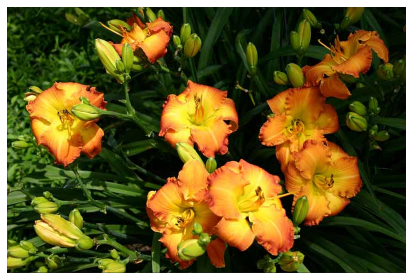
This lovely photo of H. 'At Sunset' captured blooming in the Bilchik garden at the St. Louis National Convention is Region 14's tribute to Oscie Whatley who passed away during the summer of 2005.