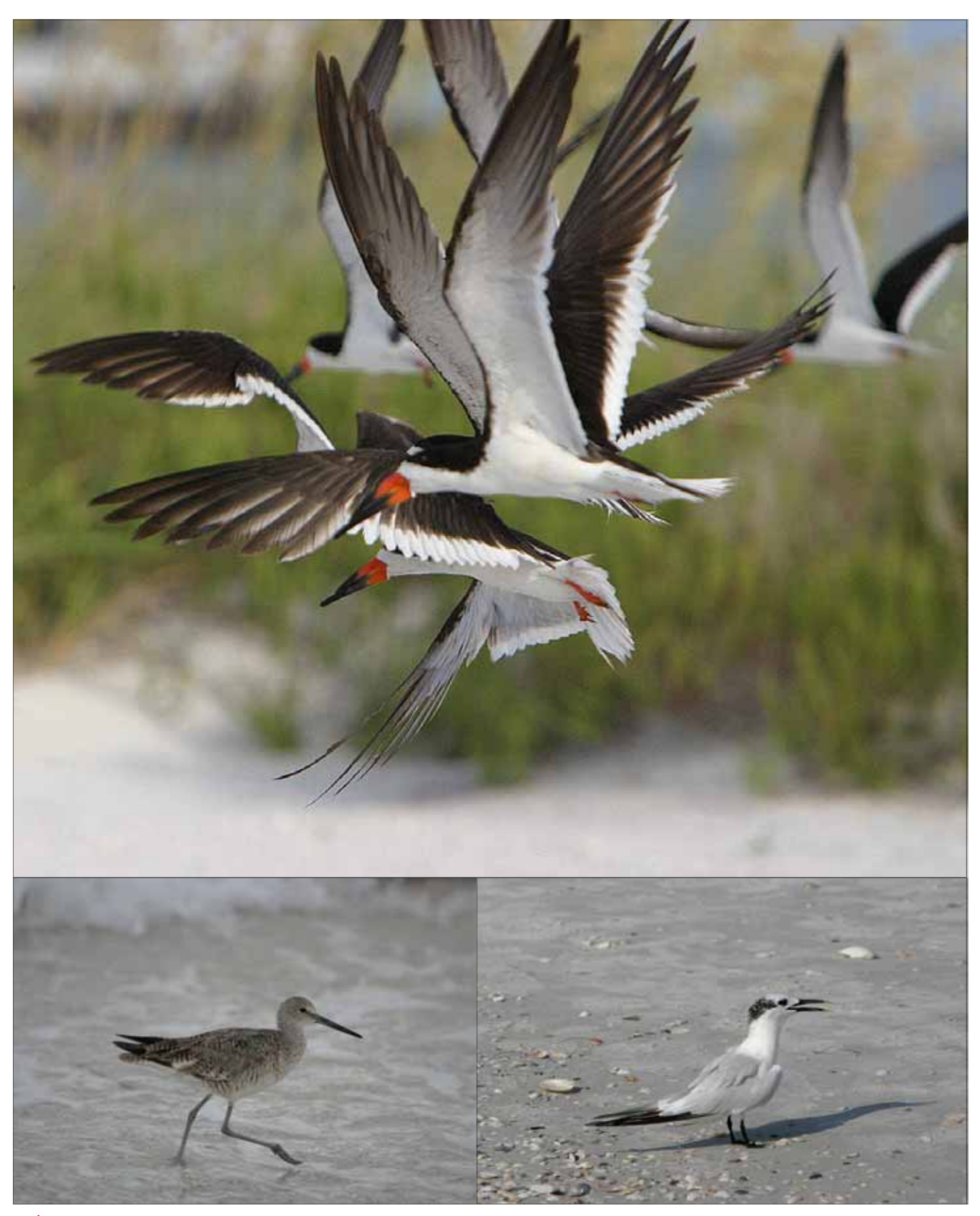
n accomplished waterfowl photographer, Paul shares his digital images on the internet. Above, Black Skimmers take flight; (below left) an immature Willet steps forward; (below right) a Sandwich Tern poses among shell litter.