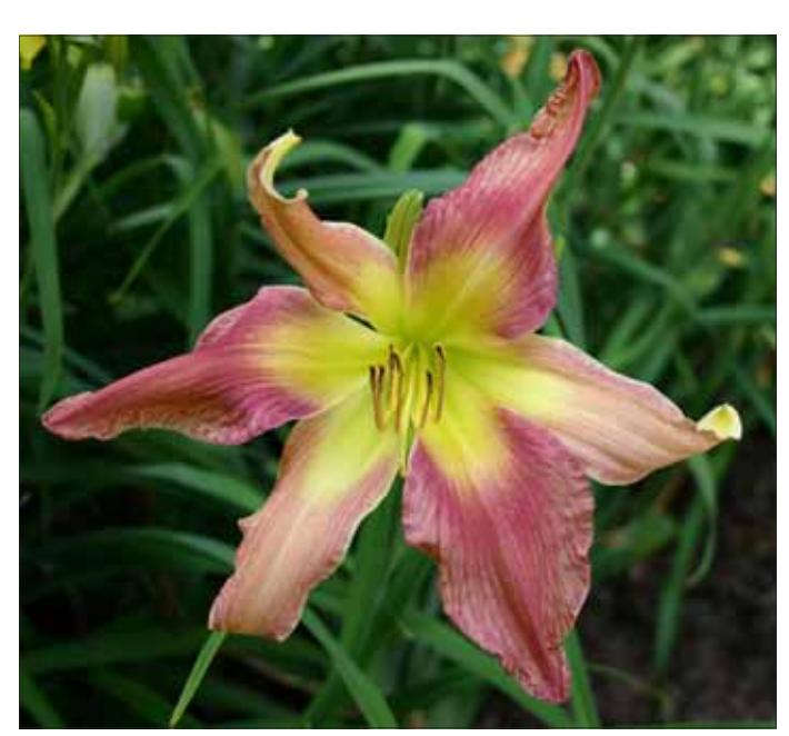
H. 'Hurly Hula Popperbait' ('04) shows off its veining within its mauve-rose petals accented with a darker rose band above a yellow-green throat.