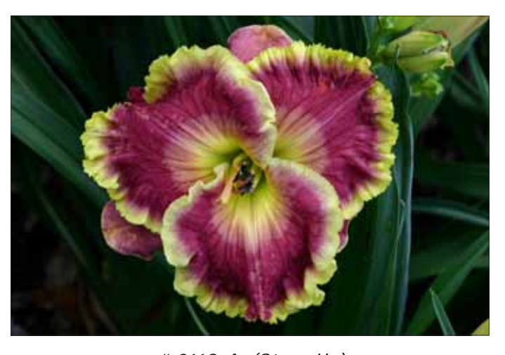
# 3118-A (Stamile)