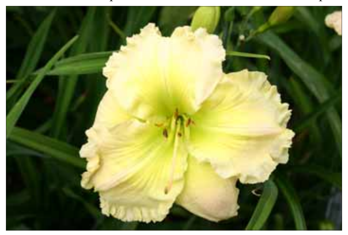
This shot is typical of a lot of photographs where care has not been taken to ensure that a lightly colored or pastel daylily has not tricked the camera into overexposure. The dark green background is partly the culprit. The daylily is H. 'Russell Henry Taft' (Carpenter, J. '02).

With automatic cameras, however, exposure can be a greater problem, particularly with landscapes. Shooting a bed of daylilies in front of a dark background, such as a woods, will generally cause the flowers to be overexposed. It is best to shoot landscapes