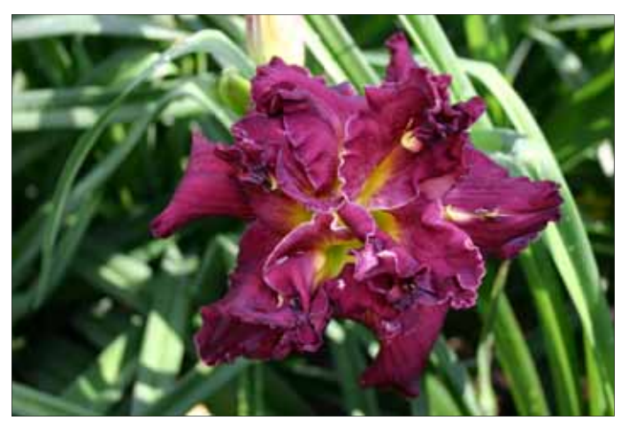
# 03-543-J (D. Kirchhoff)