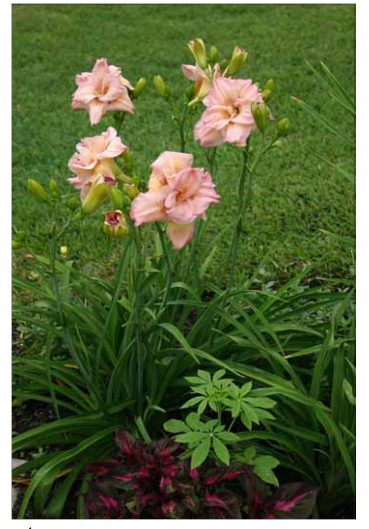
A better photograph of H. 'Music of the Master' in respect to focus and composition, there are still problems, most noticeably the gray object at the bottom left, the glaring yellow spot just beneath the flowers (a severed bloom?), and the uninteresting upper right quarter side of the photo.