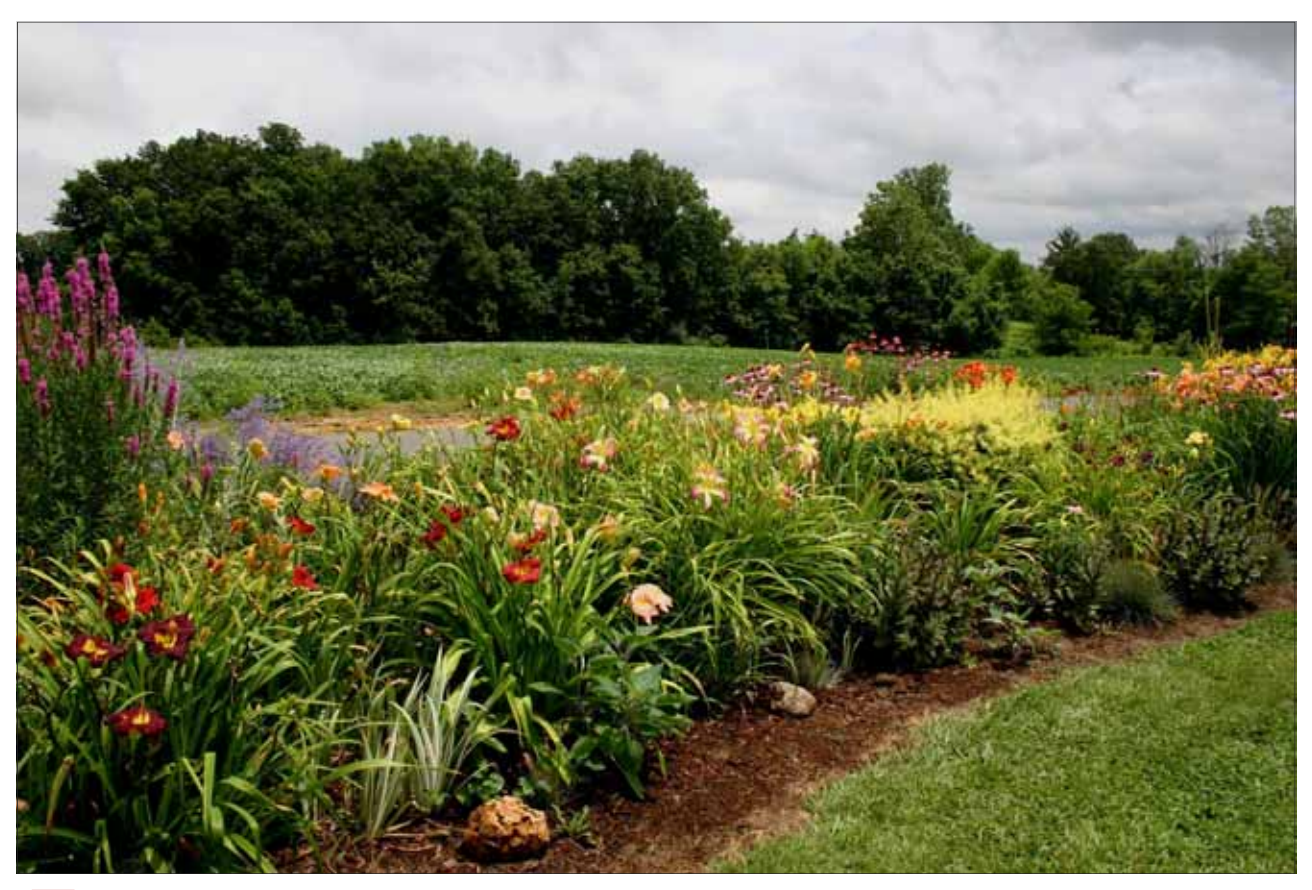
The Troy Daylily Garden (above and below), designed by Gene Fink and Duane Cookson, features a country setting on the northwest edge of the St. Louis metro area. Over 1,500 daylily varieties together with various annuals and perennials, such as purple coneflowers, delight the eye.