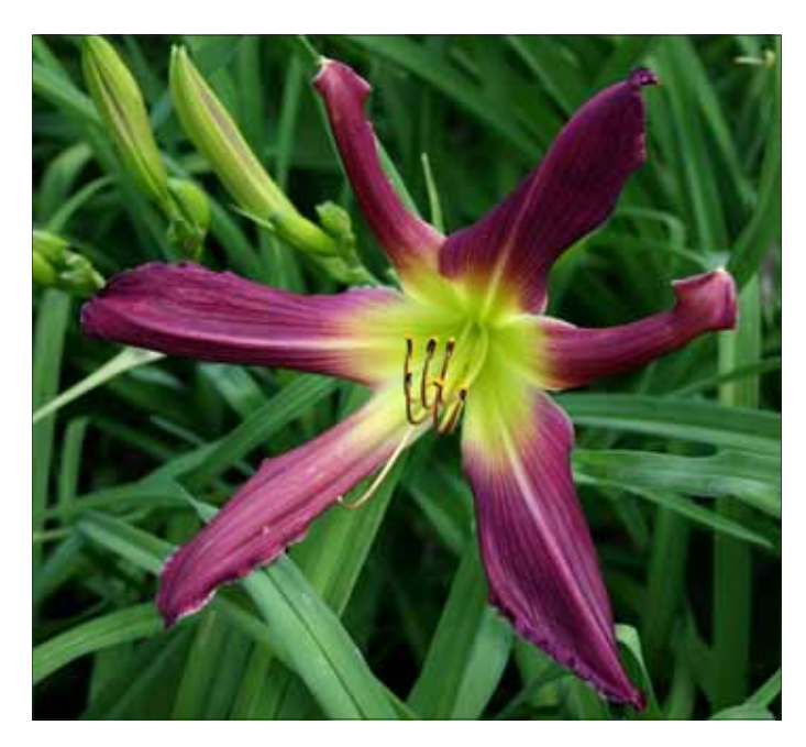
H. 'Muscadine Jiggin Minnowbait' ('03) shows off its impressive color, a muscadine purple above a green throat.