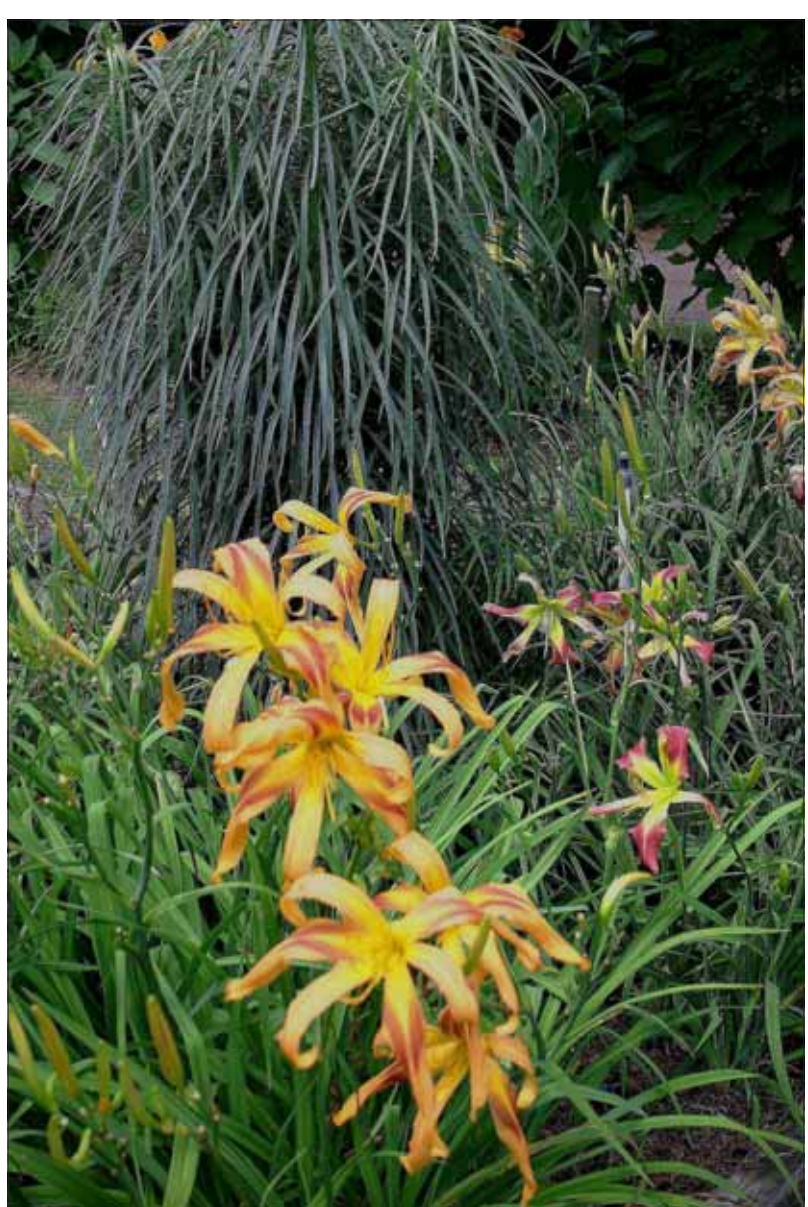
This clump of H. 'Fiesta Flippinbait' (Roberts, K. '04) planted in front of Lilium giganteum stood out the day I visited Kemberly's Gardens. Its spicy hot sherbet blooms with a scarlet band above a yellow-green throat cascade with lovely motion.

Recently, she has registered several impressive cultivars, among them H. 'Fiesta Flippinbait' ('04), a rich 9" sherbet with a scarlet band above a yellow-green throat. H. 'Pink Armadillo' ('04) is another of her favorites. A 6\frac{1}{2} " crispate, the pink petals and sepals curl