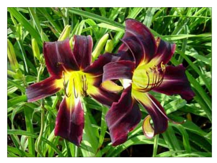
H. 'Black Ice' (Roberts '00) is a 7½" purple-black self with an intense yellow-green throat.

Among the favorite whites and near-whites, H . 'Michael Miller' (Stamile '00) had its best season ever although an early hail storm and heavy rains caused a scape to blast. I duct taped the scape and it bloomed happily on, with each and every bloom opening perfectly. This is a huge creamy white with a gold edge, and each bloom astonishes the