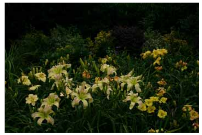
Underexposure is a problem that can occur when shooting manually. You just have to check out your instant replay on your digital camera.

what he gets. That's why an SLR is so important, either for regular cameras or digital ones. The best of the new digital cameras, now reasonably priced, are SLR's. To me, one of the most annoying aspects of the close-up photography of daylilies is for a photographer to cut off a portion of a petal or sepal, unless you're trying for a